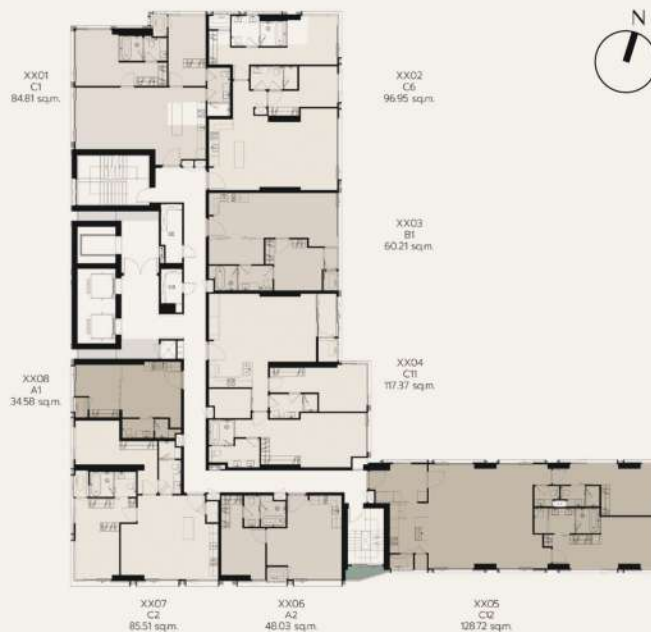
TRIPICAL FLOOR PLAN